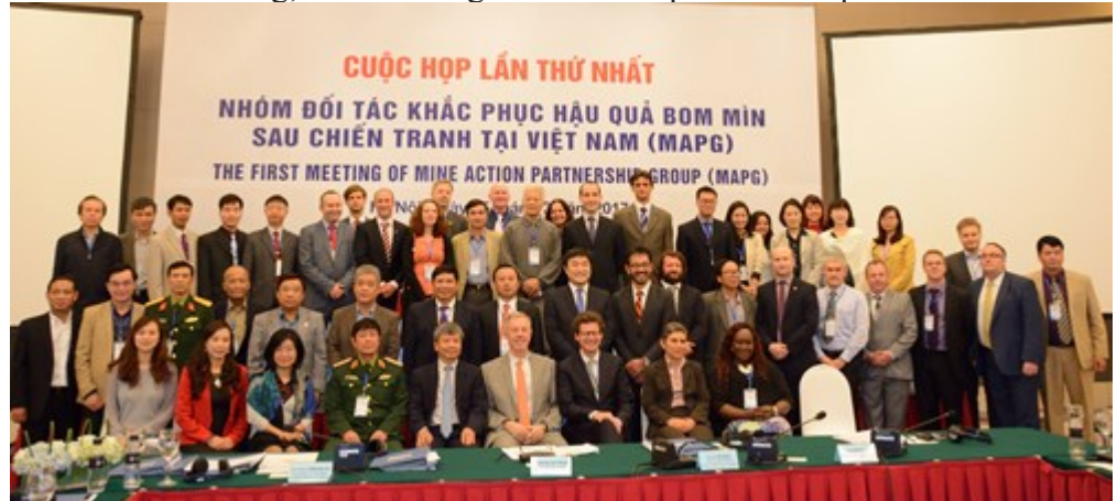
Delegates in a joint photo at the event.